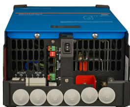
MultiPlus 2000 VA (bottom cover removed)