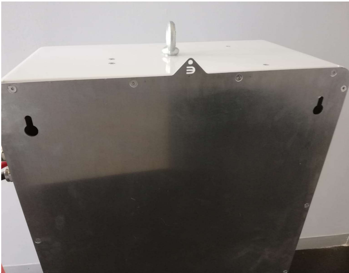
Figure 4.1 Bolt Mounting Keyhole on Rear of Lite Casing – floor mount retaining tab and fitted eye bolt also visible

Eye bolts fixed to the top of the battery can be used for hoisting the unit up to the required height for fitting to the wall. The eye bolt on the models up to the Lite 20/14 can be removed after installation. Ensure that you have one M12 x 1,75 thread eye bolt rated for 450kg or more for the models that are not supplied with permanently fixed eye bolts.