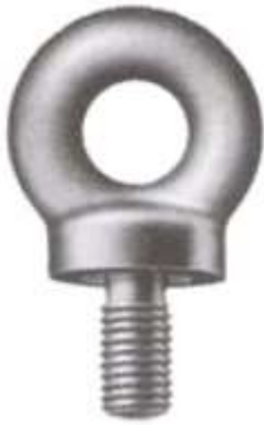
Figure 4.3 Eye bolt Installation on a Lite 15/12HV model (remove after installation)