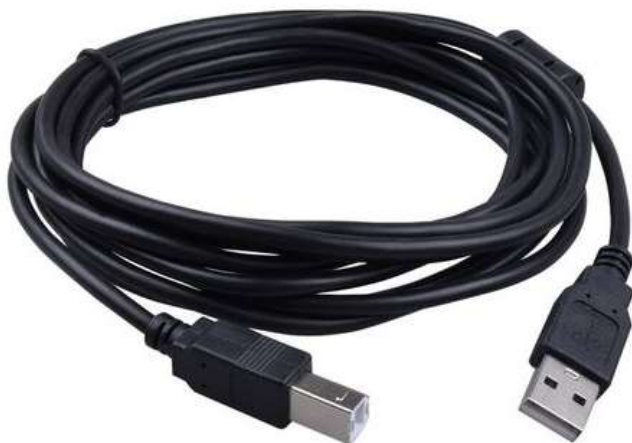
Figure 2.2 USB “printer” Cable for Programming all Freedom Lite models produced after May 2020

The ON button [11] and OFF button [12] are located beside the SoC display.