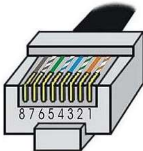
Table 5.2 Pin Configuration for CAN Bus Control Cable for various supported inverters