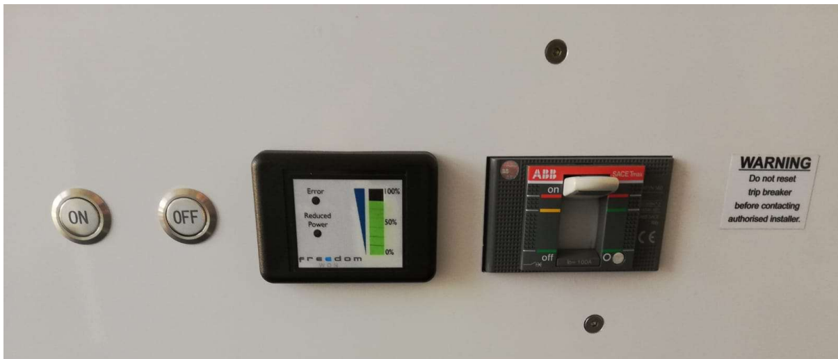
Fig 7.1 “ON” and “OFF” Buttons

To switch off the DC output from the Lite, pull down the breaker. To switch off the power to the BMS, press the “OFF” button situated to the right of the “ON” button. This will also trip the breaker if it is still on at the time. The Lite must be switched off fully when not in use to prevent self-discharge.