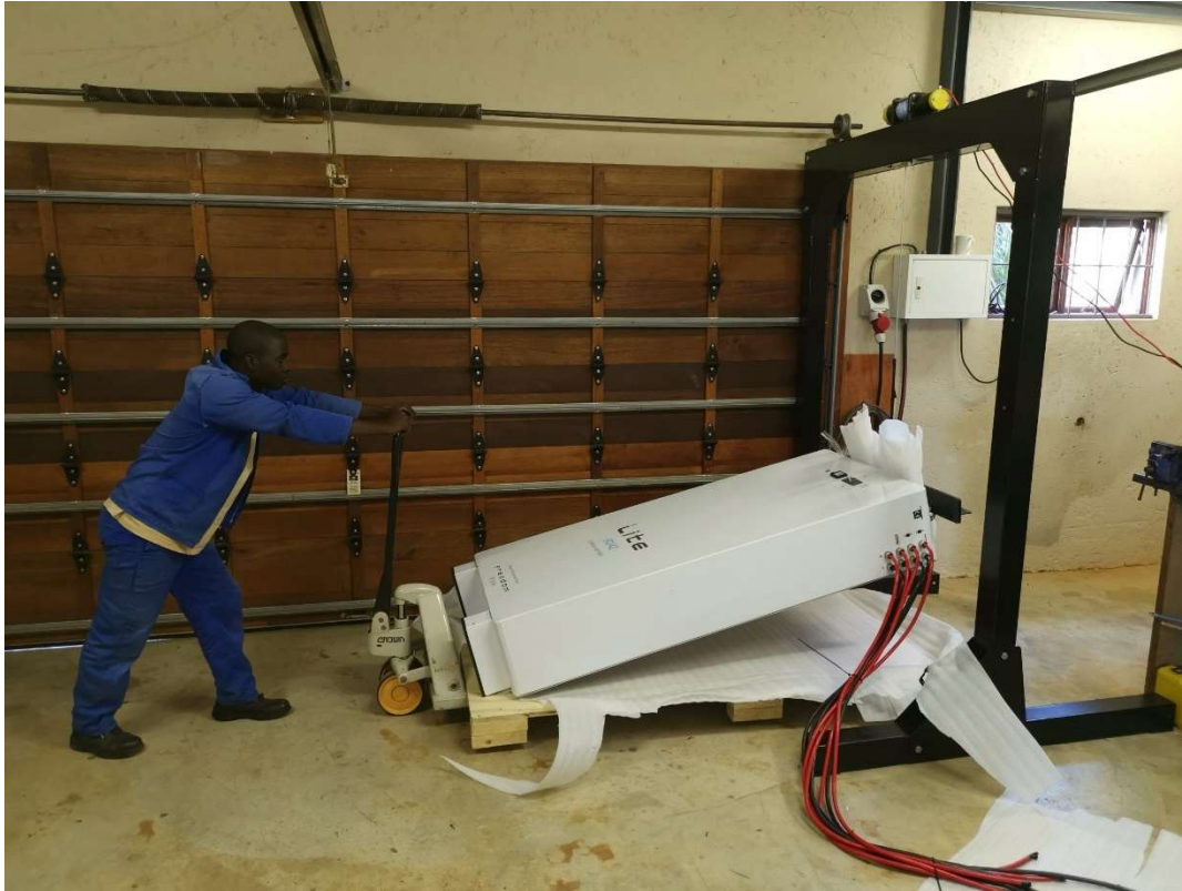
Fig 4.5 Site Assembled Gantry with Electric Hoist