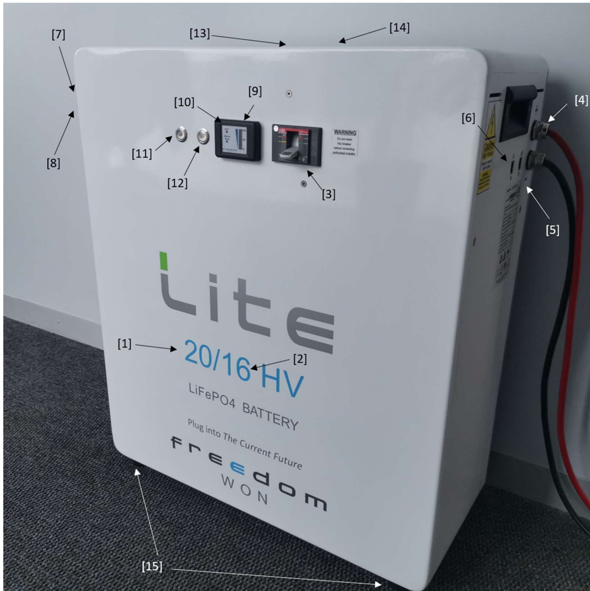
Figure 2.1 Labelled Image of the Freedom Lite Home 20/16HV (Labelling corresponds with the text)